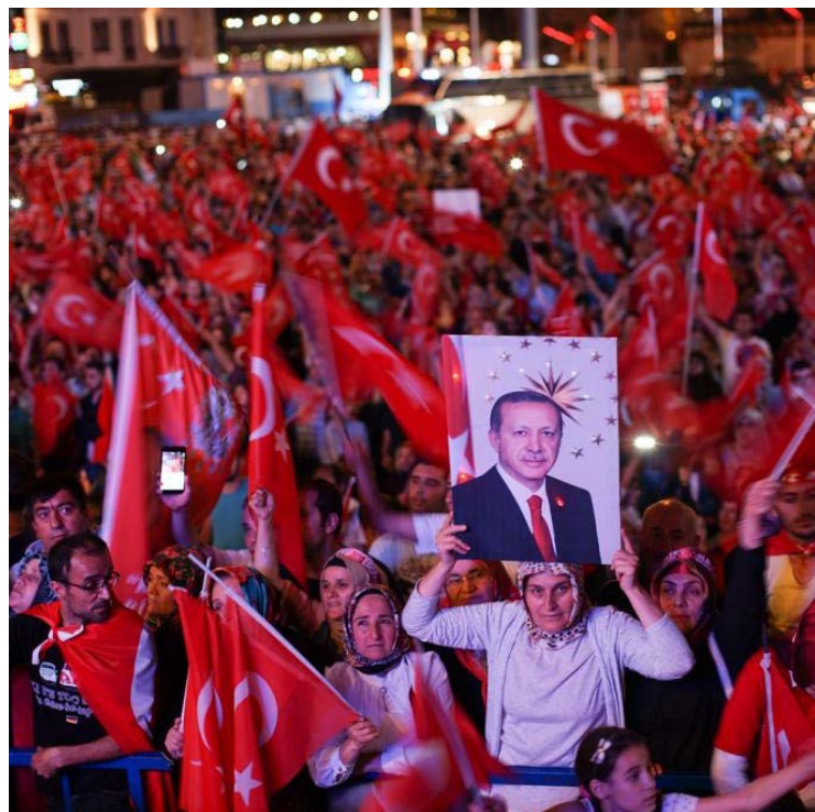
After coup nightly demonstration of president Erdogan supporters. Istanbul, Turkey 22 July 2016.